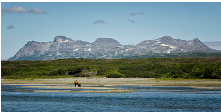
(CONCEPTS: Environment, wildness, solitude, expansive. McNeil SGS, Alaska.)

The dictionary defines 'concept' as an idea to help sell or publicize a commodity, a sense of thought, frame of mind, belief, opinion, impression. The concept is both preconceived and, if successful, understandable in the completed image.