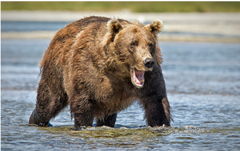
(CONCEPTS: danger, fear, large, risk, strength, power. Waterfall, McNeil SGS, Alaska.)

"you get what presents itself." Often a photo conveying a concept is staged, but more and more I work with the elements to define the behavior, action or emotion which my subjects express. Then later, once home and at the computer editing images, I'll assign a concept to an image.