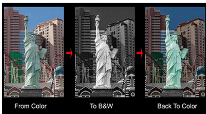
image. We will explore a variety of approaches to pulling values from color images using zone system approaches with the use of your Channels."

Stephen Burns has been a corporate instructor and lecturer in the application of digital art and design for the past 15 years internationally. He has been ex-