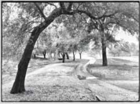
Theresa Jackson "Orchard View"

Please go online to see full-color images. Click an image online to see a larger version.