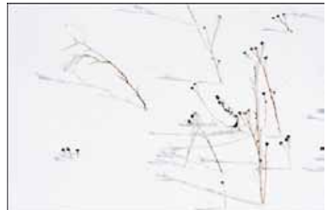
Priscilla Monger "Twigs in Snow" Honorable Mention

Note: These photos are a sampling. Not all award-winning photos were available for this publication.