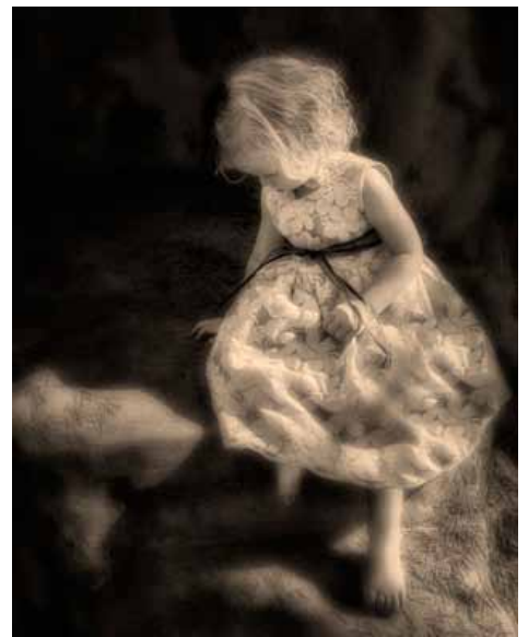
Francine Filsinger "Innocence of Aviya" HM: Black & White People