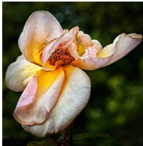
Sonja Longely "A Last Hurrah" Honorable Mention