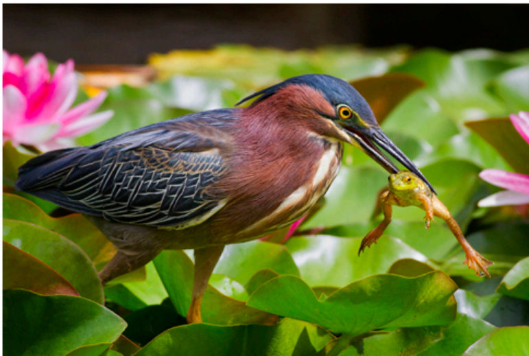
2011 Best of Show "Kermit Meets Big Bird" Mark Drawbridge

17th Annual NCPS Members' Photography Show October 12 - November 24, 2012 Encinitas Library - Community Room 540 Cornish Drive Encinitas, CA 92024 (M-T 9:30 am-8 pm - F, Sat 9:30 am-5 pm - Sun noon-5 pm)