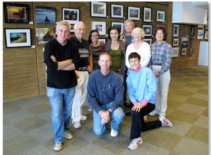
Picture hanging crew