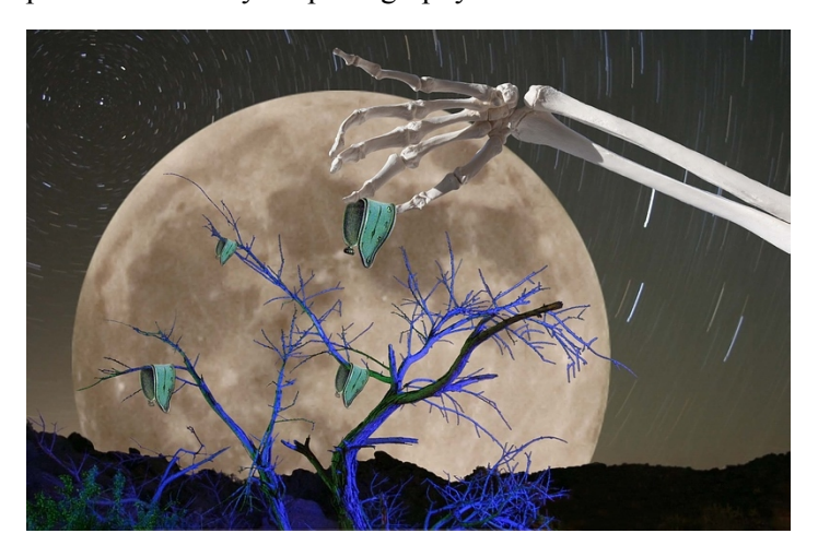
My website is www.nightowlphotography.com

The beauty of digital compositing is being able to put together images that are only marginally interesting by themselves, but wonderful-maybe even spectacular- when added to each other. I will show some digital composites and explain the steps with each image that I used to create them. Sometimes one image leads to another, but sometimes we have to shoot photographs to fit ideas we have. I will show examples of each of these, along with some images that came to me fully formed in dreams. These just required me to make them happen (which is much easier said than done!). Your subconscious can be a powerful tool in your photography.