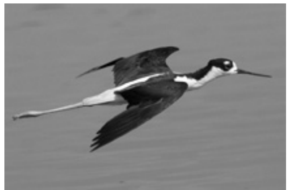
Black-necked Stilt

Date: Saturday, June 23, 2007 Time: 9 am – 3 pm Meet: Park & Ride, I-5 (east side) and La Costa Ave. (north side), in Carlsbad