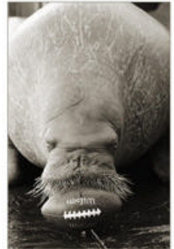
Super Bowl 2003